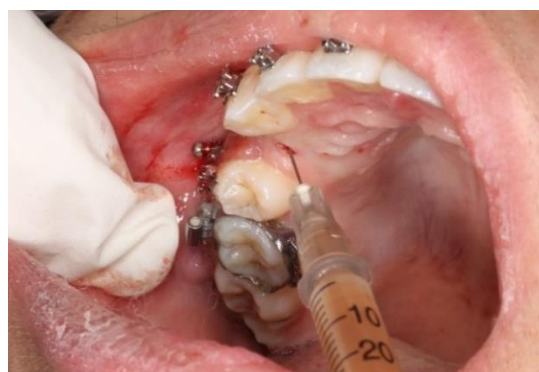
Figure 3. PRP submucosal injection into the palate on the research side.

A nickel-titanium closed coil spring that was stretched between the canine hook and the mini-screws and provided a retraction force of 150 gm on each side was used to start the canine retraction after PRP injection. A force gauge was used to alter the force level (040-712-Dentaurum, Correx 100-500 gm, Pforzheim, Germany).