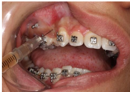
Figure 2. Buccal PRP submucosal injection on the research side

The study side underwent local anesthesia to manage pain before PRP injection. The buccal and palate mucosa distal to the dog were then submucosally injected with 30 PRP units in six injection sites. The buccal mucosa contains three injection sites. Three millimeters away from the canine was the first one. Three millimeters separated the first and second ones. Additionally, the distance between the second and third injection points was 3 mm. The palatal surface underwent the same process ( Figures 2 and 3 ). Every injection had the same volume (5 units per location), was administered solely before canine retraction, and was never repeated. The control side was not injected.