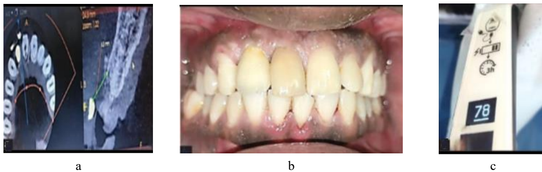
Figure 4: Group B – Postoperative: (a) Cone-beam computed tomography (after 6 months); (b) Clinical photograph; (c) Implant stability quotient (after 6 months)

From baseline to 6 months, the mean values of crestal bone loss (both mesial and distal markers) were significant and showed that delayed implants under immediate loading experienced less crestal bone loss than instantaneous implants under immediate loading. These findings were consistent with those of Chaushu et al. [21] who examined the clinical effectiveness of loading implants right away in newly extracted sites versus healed sites and found that doing so exhibited a 20% chance of implant failure. This study coincided with the findings of den Hartog et al. [22] Mangano et al. [23] and Keshari et al. [24] which supported quick loading of a single implant as a successful and safe operation and reported less marginal bone loss. These results contrast with those of Pitman et al. [25] who discovered no discernible variation in crestal bone loss between immediate implant loading and traditional loading.