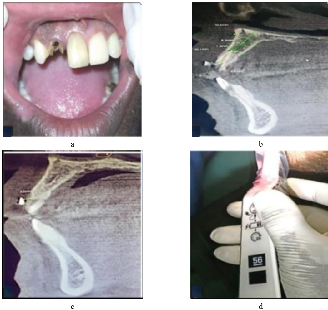
Figure 2: Group B – Preoperative: (a) Clinical photograph; (b) Cone-beam computed tomography (baseline); (c) Stent placement; (d) Implant stability quotient values (baseline)